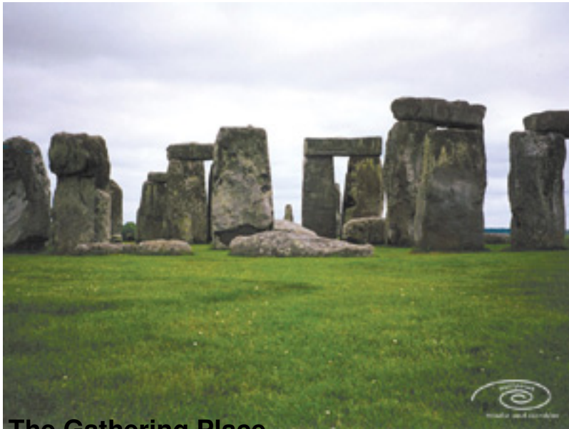
The Gathering Place

Download this Desktop Background How to set Desktop Wallpaper